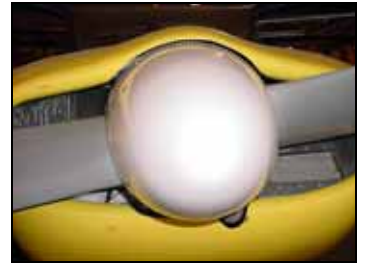
LEFT SIDE Clearance between the aft edge of the prop and cowl.