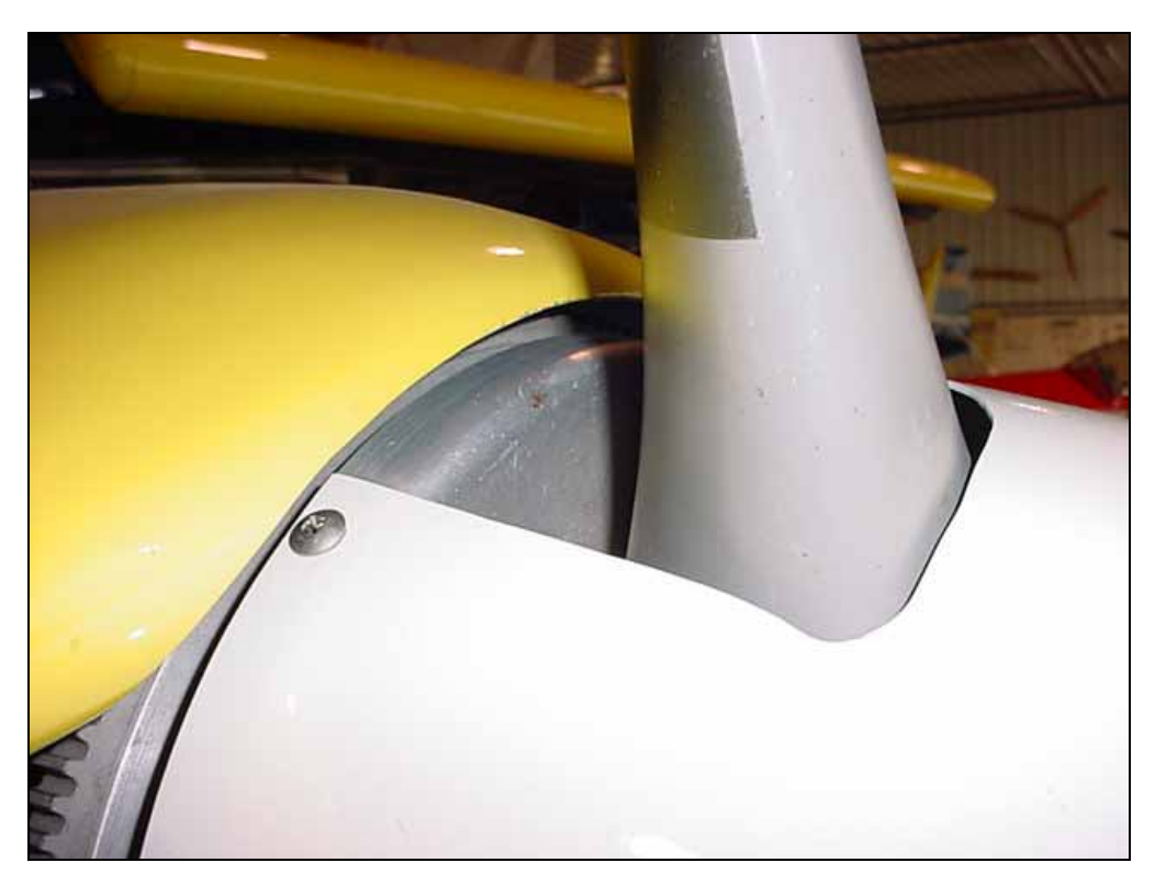
top cowl: photo taken standing in front of left side.