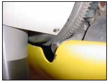
BOTTOM COWL Clearance between aft edge of prop and bottom cowl.

Photo taken standing on right side of spinner.