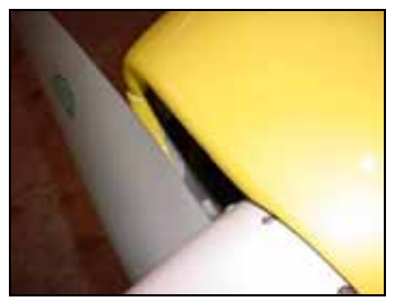
RIGHT SIDE Clearance between the aft edge of the prop and cowl