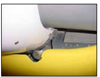
Bottom 10mm Clearance

Aft edge of the spinner extends back behind the front edge of the bottom cowl.