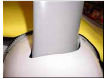
TOP COWL Clearance between aft edge of prop and cowl.