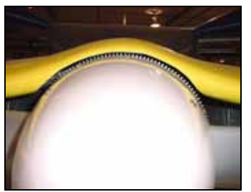
Cutout in top cowl of make room for spinner

Photo looking back at the right side top of spinner.