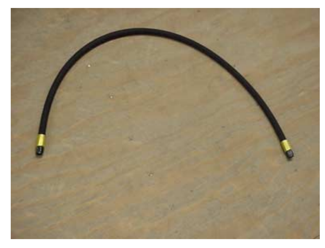
Oil line Assy. P/N 20-SAF-3 With fire sleeve protection