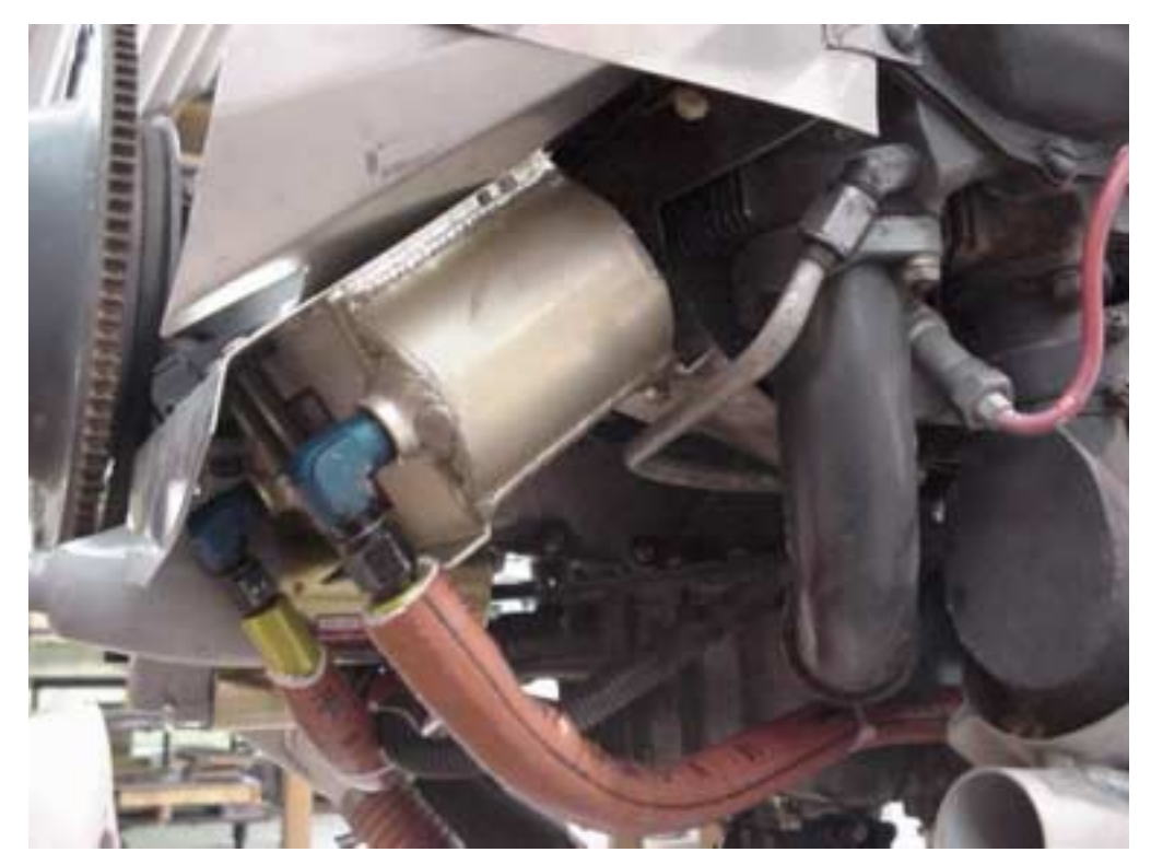
Screw in the outboard 90 degree elbow and check that there will be no interference with the bottom cowl.

Note: in this photo the top of the oil cooler mounting bracket is not cutout as in the supplied part. The front support is weld with the small flange pointing up; the top support is welded with the flange down.