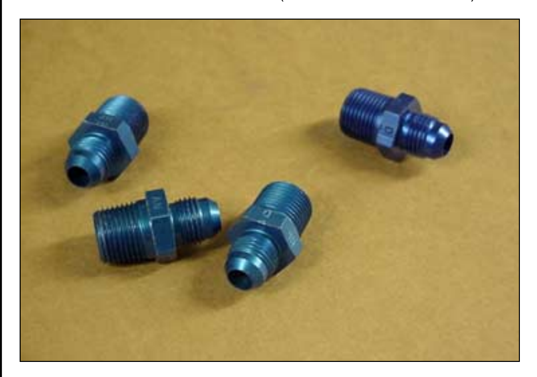
3/8" FEMALE NPT TO 3/8" MALE NPT (NATIONAL PIPE THREADS)