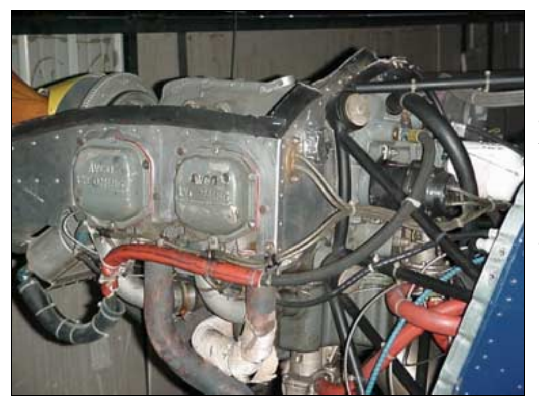
SAME FITTINGS AND HOSE USED FOR THE LEFT AND RIGHT SIDES

OIL LINE ROUTING ABOVE THE EXHAUST (Red heat shield)