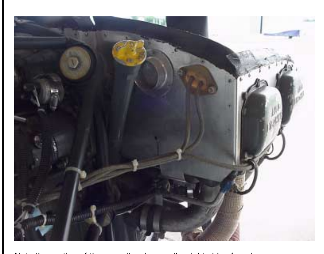
Note the routing of the magnito wires on the right side of engine.