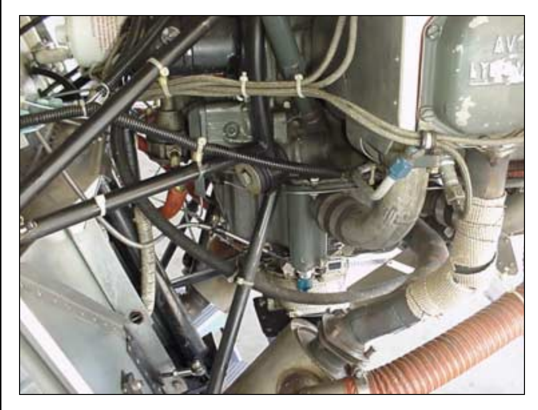
ROUTING OF OIL LINE UNDERNEATH ENGINE - RIGHT SIDE -