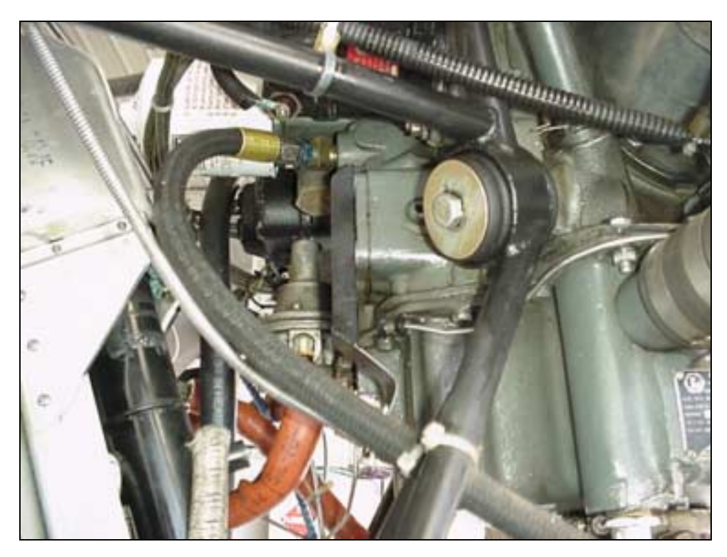
SAME FITTINGS AND LINES USED FOR THE IN AND OUT LINES

ROUTING OF OIL LINE TO THE BACK RIGHT SIDE