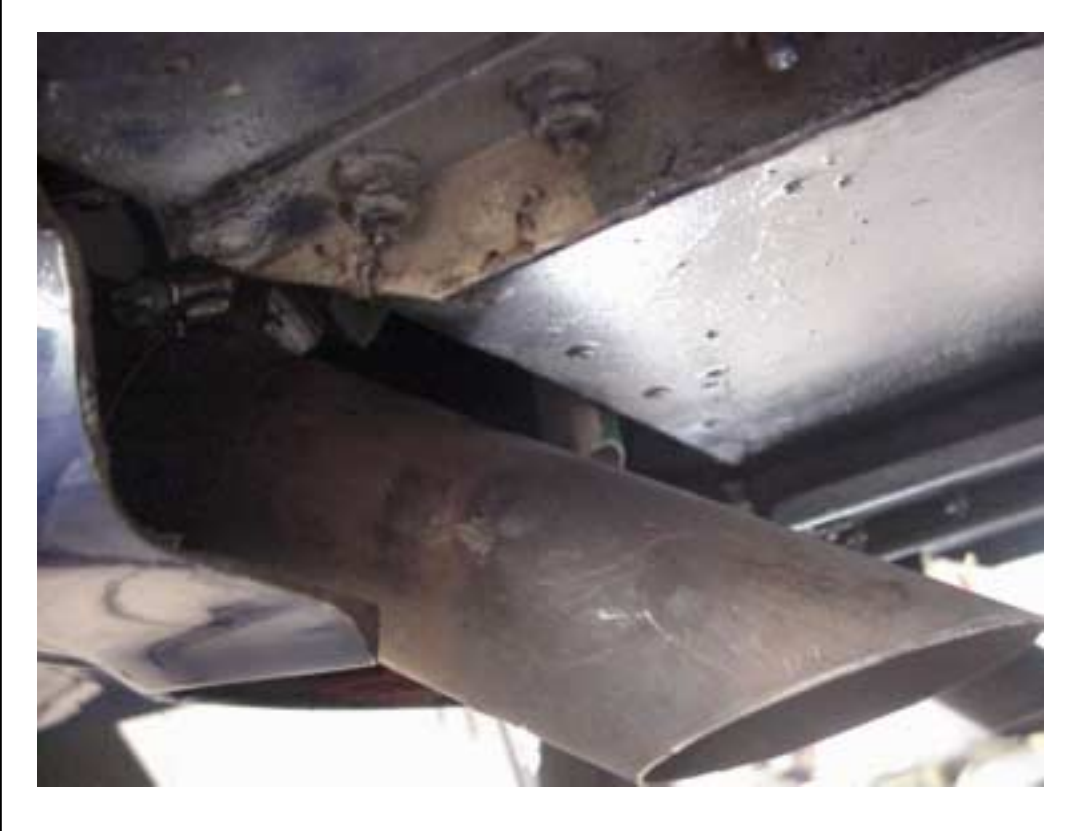
MINIMUM OF 15MM BETWEEN THE MUFFLER AND THE FUSELAGE BOTTOM SKIN