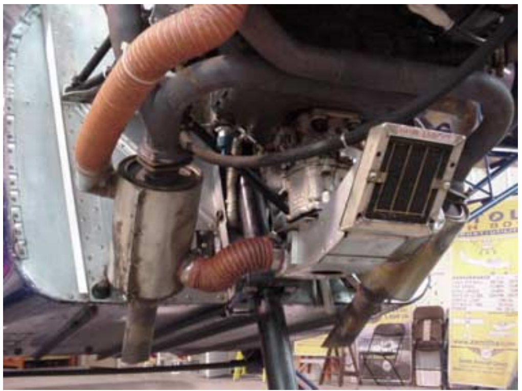
Cross over muffler. Carb heat is on right side, and cabin heat is on right side.