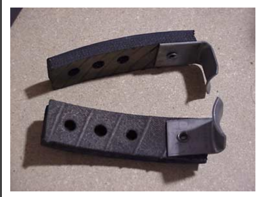
MUFFLER HANGERS TPH5 QTY=2