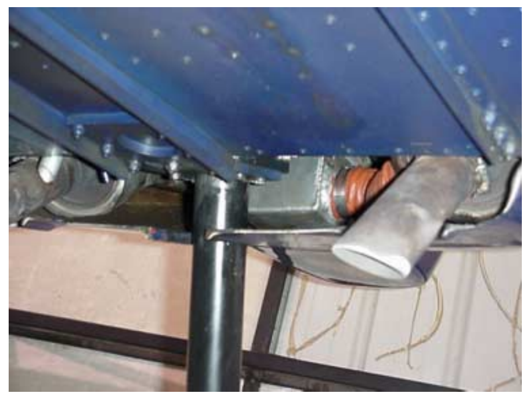
MUFFLER IN LINE WITH THE CUOUT IN THE LOWER COWL