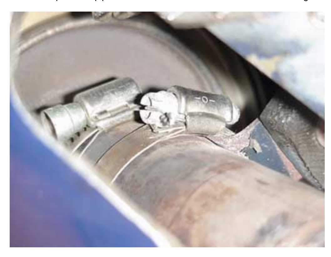
Hose clamp around pipe and steel bracket at the end of the muffler hanger.

PHOTO: LOOKING UP AT LEFT SIDE FROM UNDERNEATH THE AIRCRAFT WITH THE COWL INSTALLED.