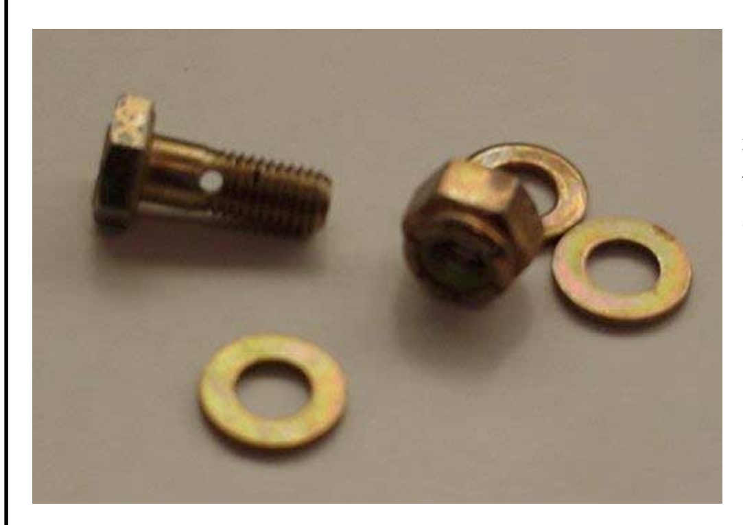
AN4-5A bolt With 5/64" hole drill through the shaft