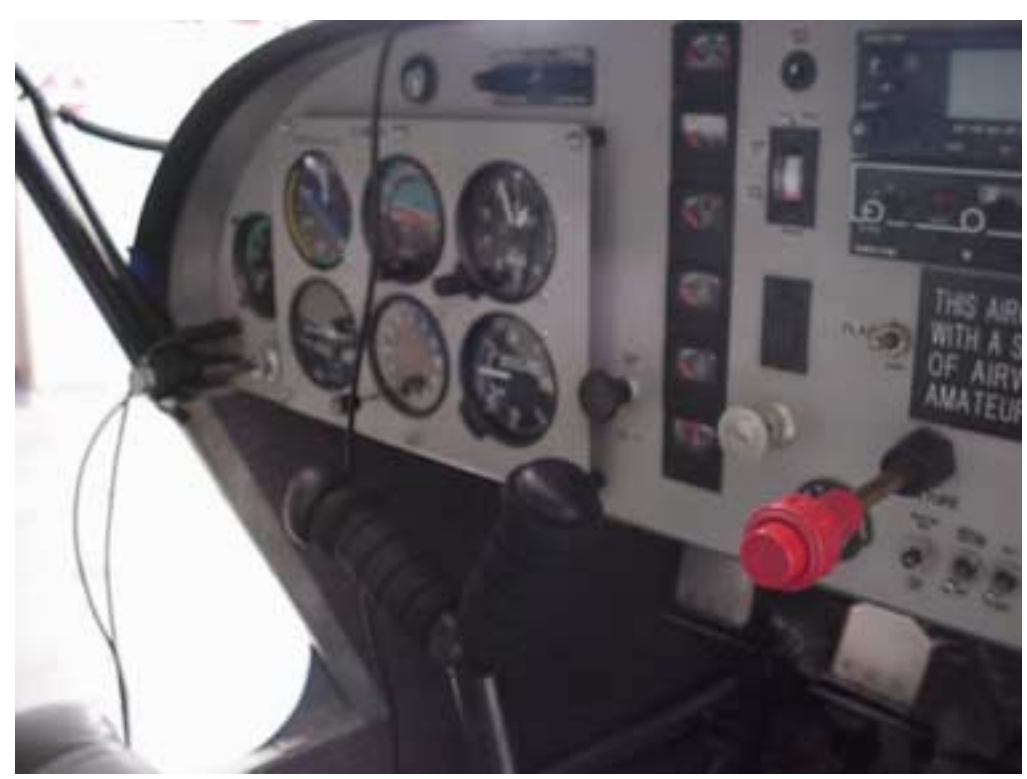
Mixture Red Knob Vernier Control