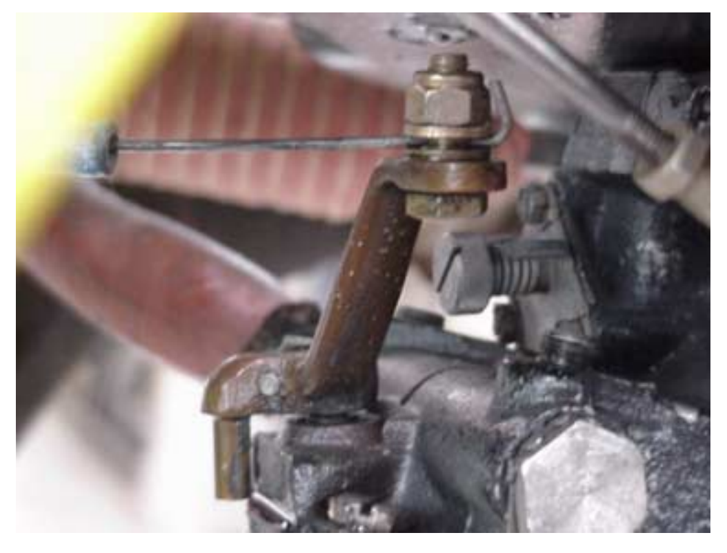
Mixture rich (Control push in)

Notice the stop at the bottom of the lever arm with the carb body.