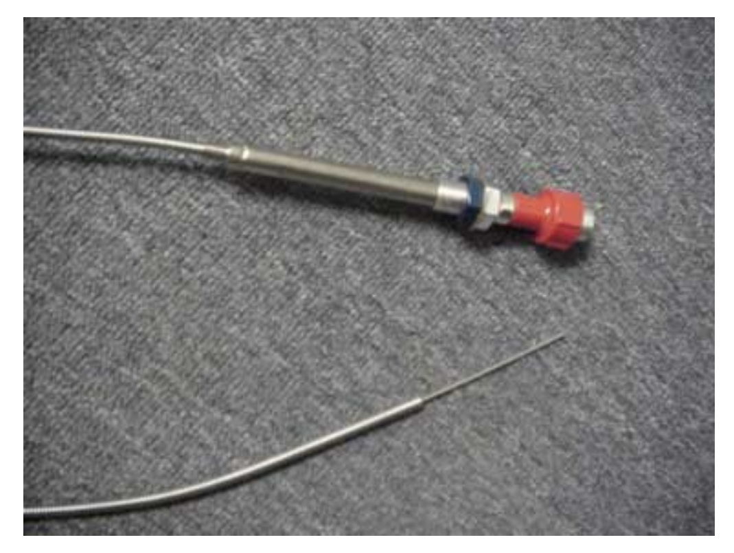
Vernier control P/N 05-08160 Length=60 inches