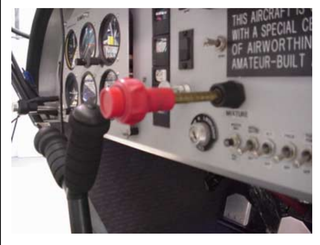
.078" diameter stainless steel wire core.

Remove the nut and Insert cable from the front side of the instrument panel