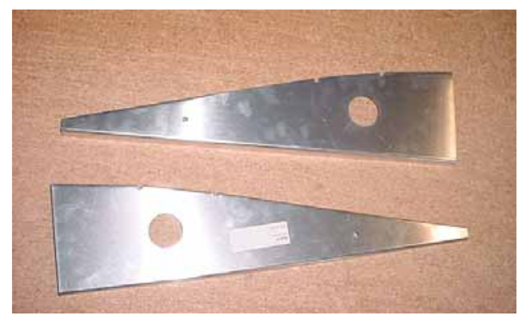
TIP BACKING RIB 8H4-5 qty= 1L +1R