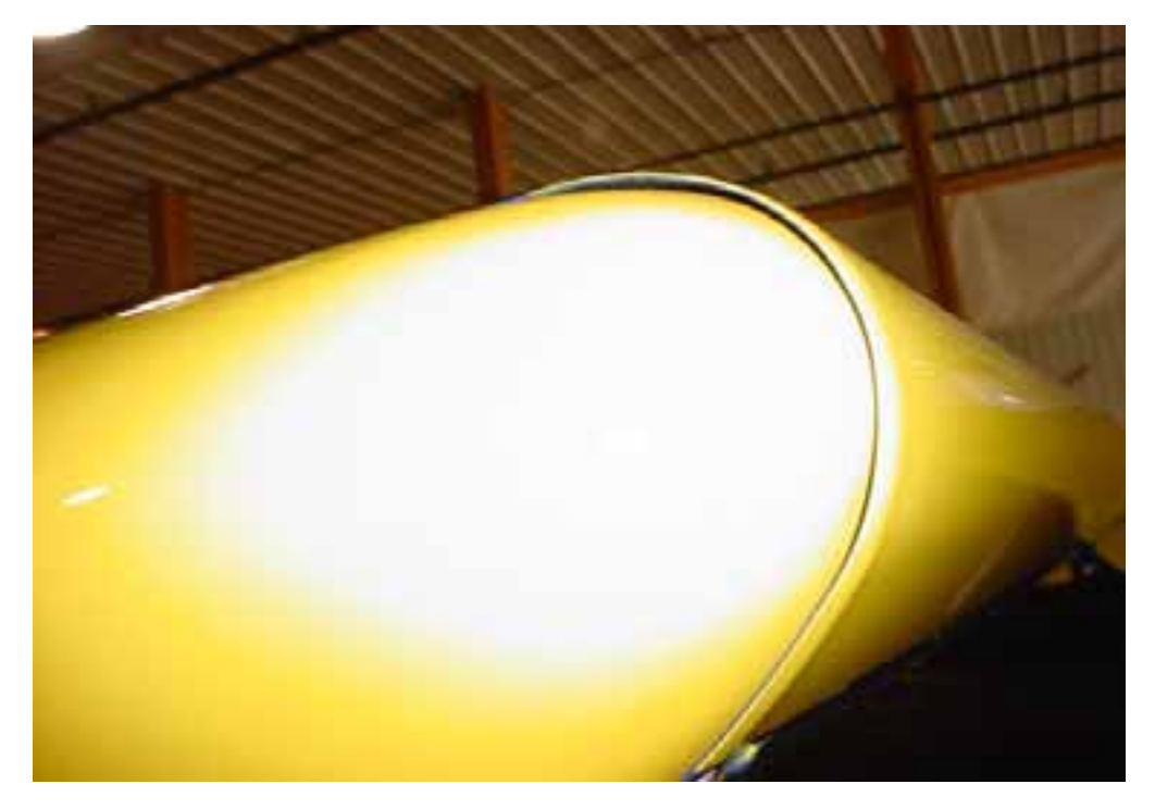
Push the fiberglass H.T. tip into the radius of the skin