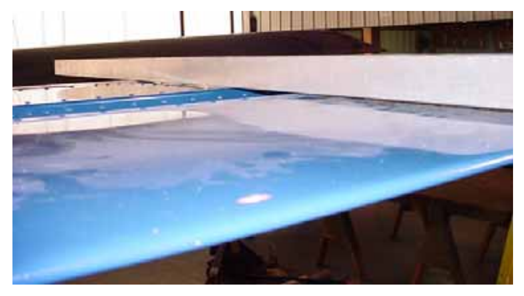
Elevator neutral position: lay a straight edge over the top of the stabilizer, bring the elevator to the straight edge.