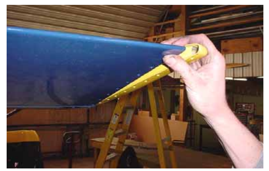
CHECK: Position the ends of the fiberglass tips in line with the trailing edge of the elevator (when elevator in neutral position).