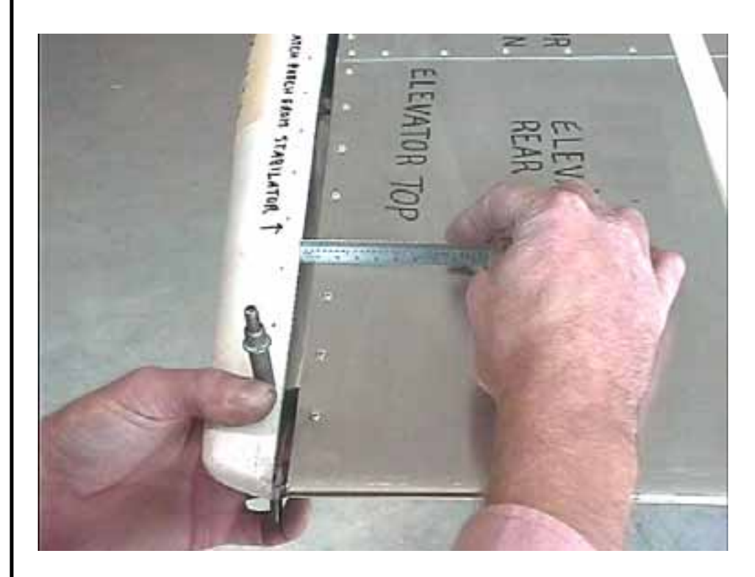
Keep the gap uniform - about 5 to 6mm is good.