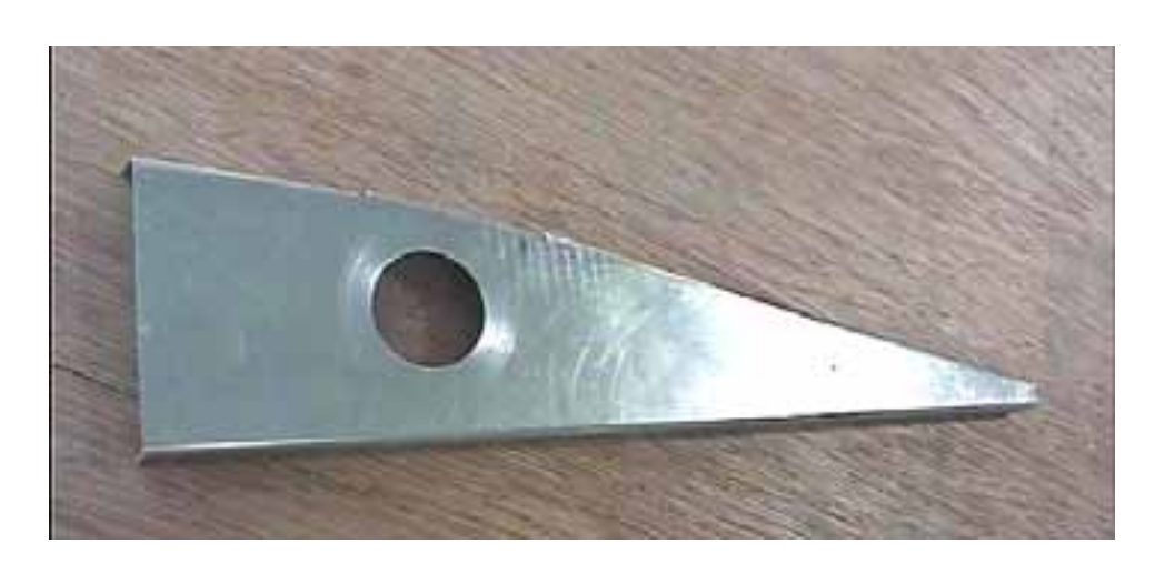
The tip rib.