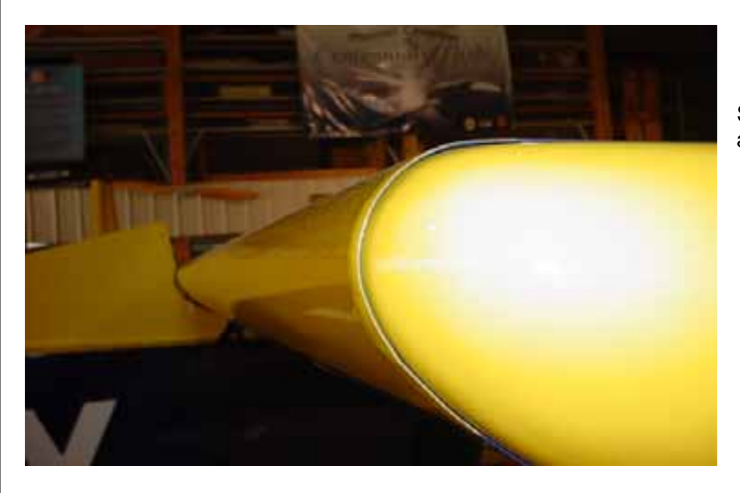
Small gap is acceptable.