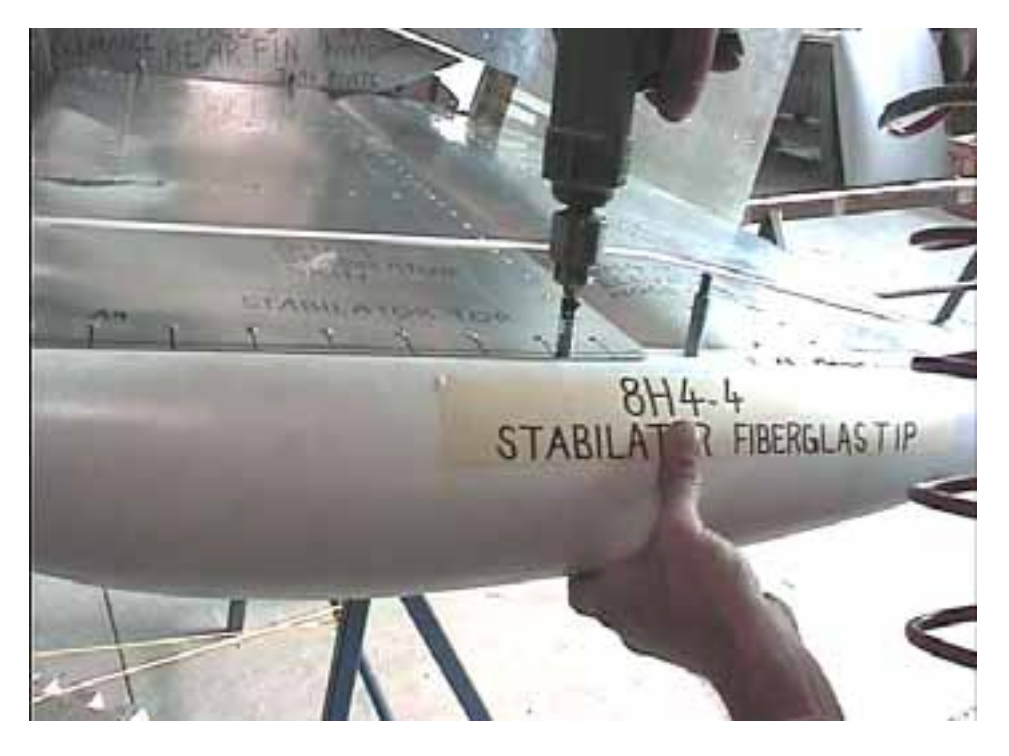
A4 PITCH 40 8H6-3 into 8H4-4

Hold the tip in place and drill one hole at either end. Stand back and take a look if you are satisfied; continue drilling and clecoing the tip in place. Repeat for the other side of the horizontal tail.