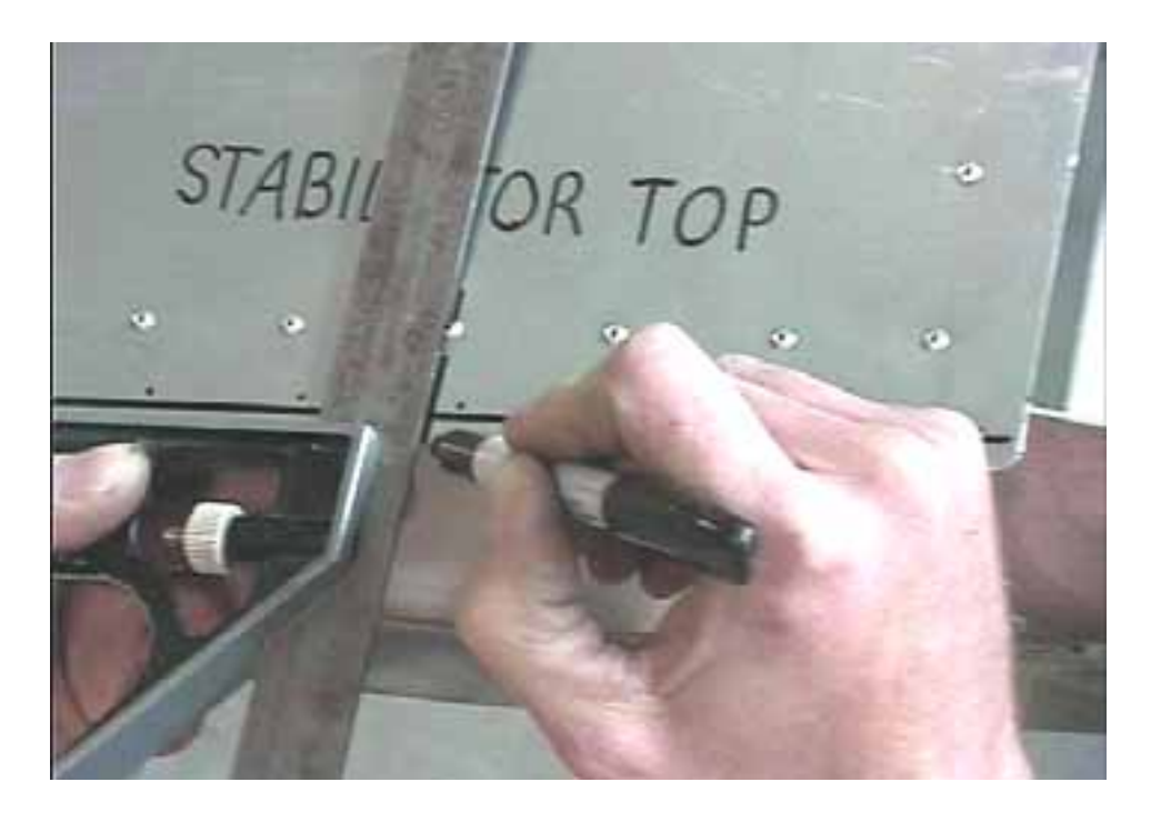
Extend the rivet centerlines as shown.