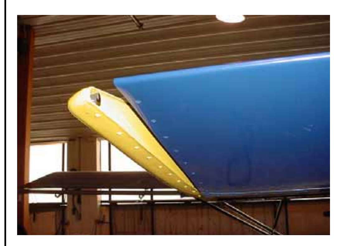
Acceptable misalignment between the left and right of the fiberglass tips and the elevator trailing edge.