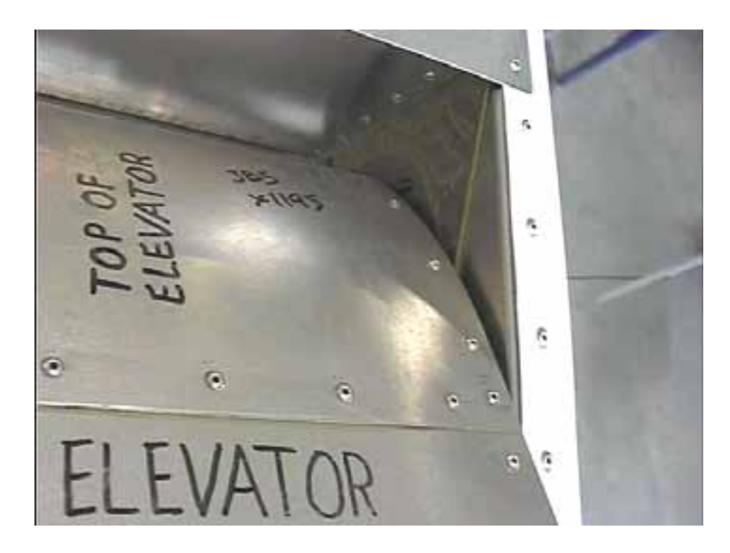
A4 PITCH 40 8H4-4 into 8H4-5

Install the tip rib behind the elevator hinge.