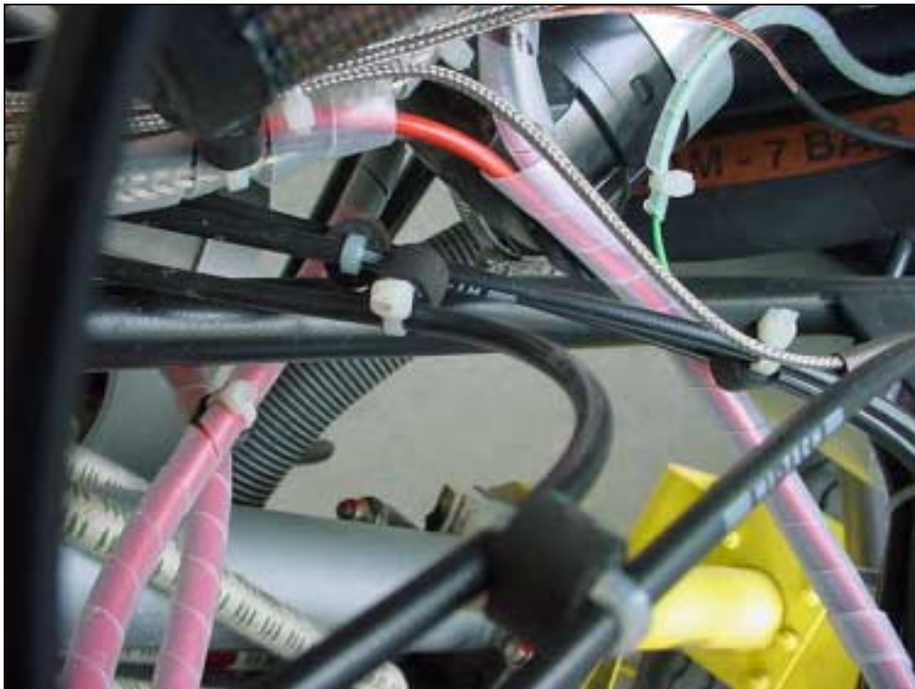
Tie wrap all wires