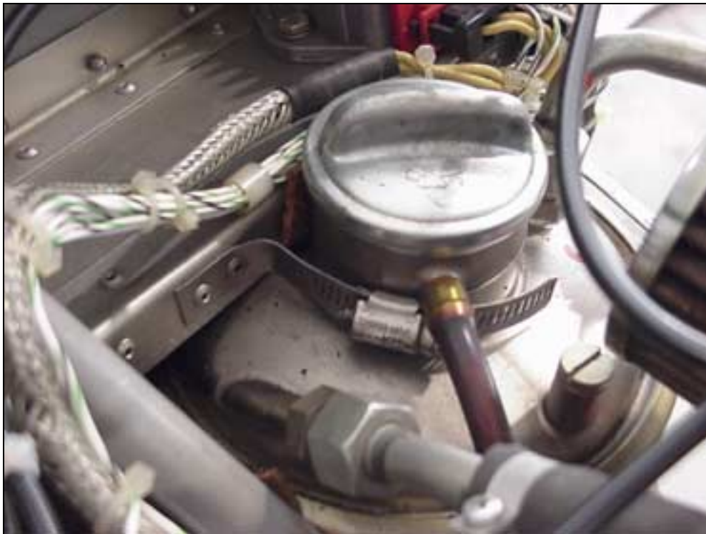
Oil tank breather and overflow line (plastic hose connected to nipple on neck of oil reservoir). Line ends just below bottom of fuselage, at firewall.