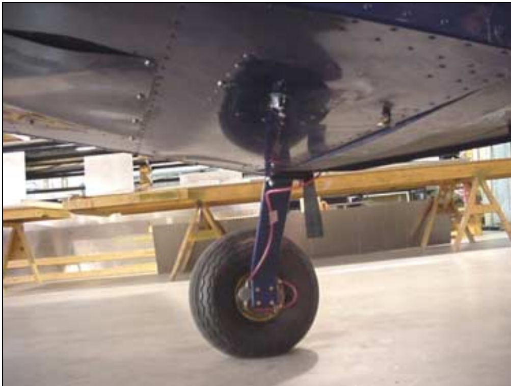
Battery position on the right side of fuselage, between the gear and the rear fuselage access panel.