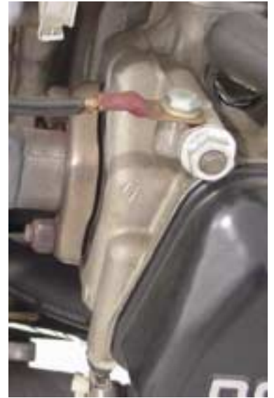
Grounding of engine to airframe (right side of engine)