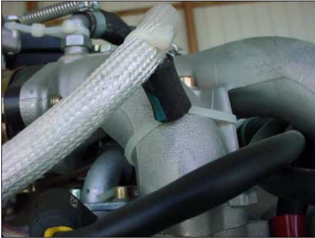
Stand off with tie wrap and piece of rubber hose