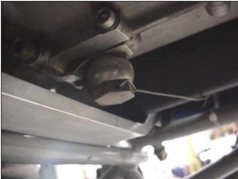
Rear cylinder on right side.

Safety wire the banjo bolt, oil fitting on the bottom of the engine.