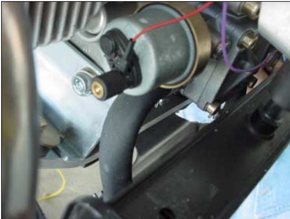
Electrical connection for oil pressure sender