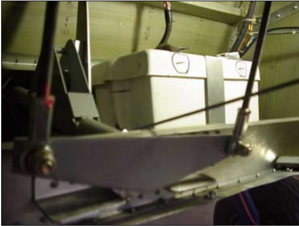
Fiberglass battery box with lid, vend underneath fuselage.