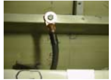
Airframe is grounded