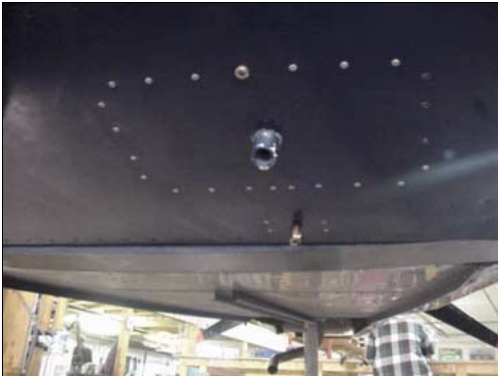
Battery vent, screw to hold the battery strap, rivets through reinforcement L angles