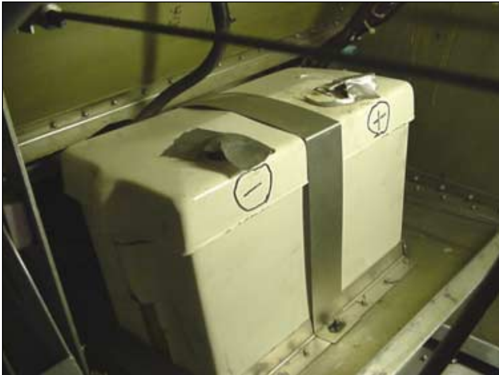
Reinforcement L angles around base of battery box Strap around the top of the battery box