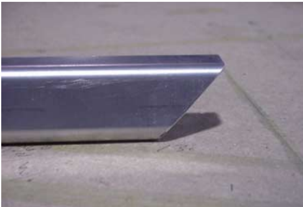
7F5-3SP Top Channel

To cut the proper angle on the Top channel, position the Channel and mark a line using the Side Channel as a template.