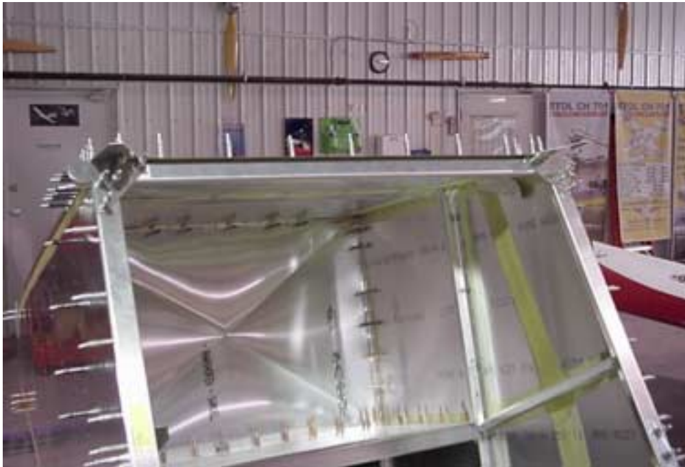
7F5-3SP Top Channel

Clamp the Top Channel behind the Rear Wing Attachment 7F5-1SP. Check that the Channel is up against the upper Longerons 7F3-1 (the ends of the Channel do not interfere with the bend radius of the Longeron). Drill and cleco the Wing Attachment to the Top Channel. Then drill the rivet line on the Top Skin through the Channel, first check for proper edge distance.