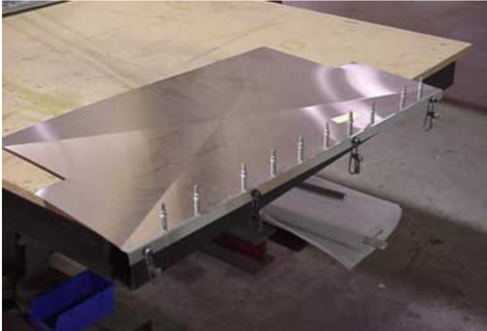
7F5-7 Baggage Floor

Layout and cut the Baggage Floor. On the front flange of the Baggage Floor there is Standard 'L' Angle located on the inside of the flange. Drill and Cleco A4 Pitch 40.