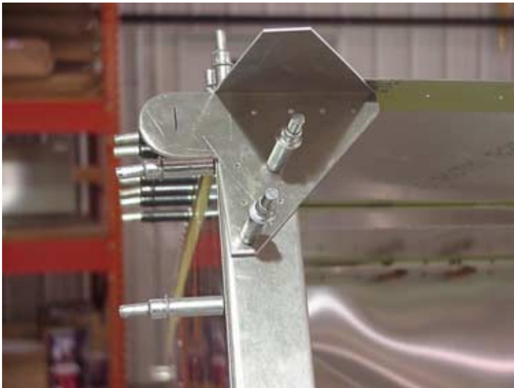
7F5-1SP Rear Wing Attachment 7F5-2SP Side Channel

Clamp the Rear Wing Attachment to 7F5-2SP. The Bracket will not be square on the Side Channel 7F5-2SP.