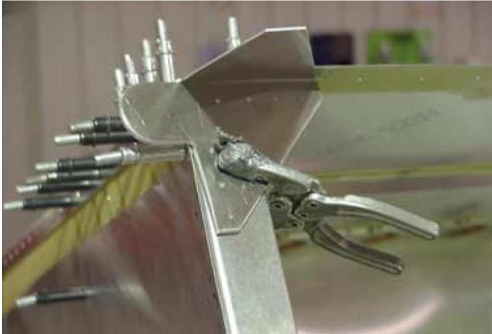
7F5-1 SP Rear Wing Attachment

Clamp the Rear Wing Attachment to 7F5-2SP. The Bracket will not be square on the Side Channel 7F5-2SP.