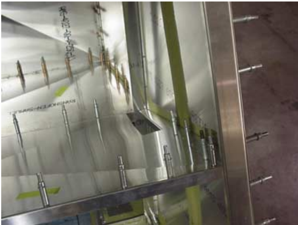
7F5-7 Baggage Floor

Layout and cut the Baggage Floor. On the front flange of the Baggage Floor there is Standard 'L' Angle located on the inside of the flange. Drill and Cleco A4 Pitch 40.