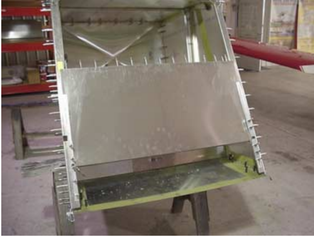
7F6-4 Seat Back

Cut the Seat Back to 7F6. Position the Seat Back flush with the Baggage Floor.