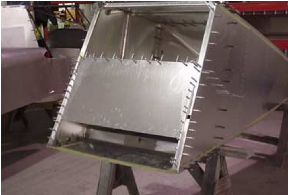
7F6-4 Seat Back

Cut the Seat Back to 7F6. Position the Seat Back flush with the Baggage Floor.