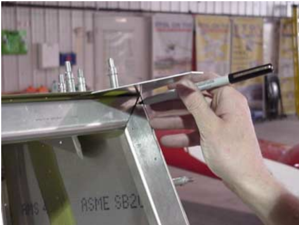
7F5-3SP Top Channel

To cut the proper angle on the Top channel, position the Channel and mark a line using the Side Channel as a template.