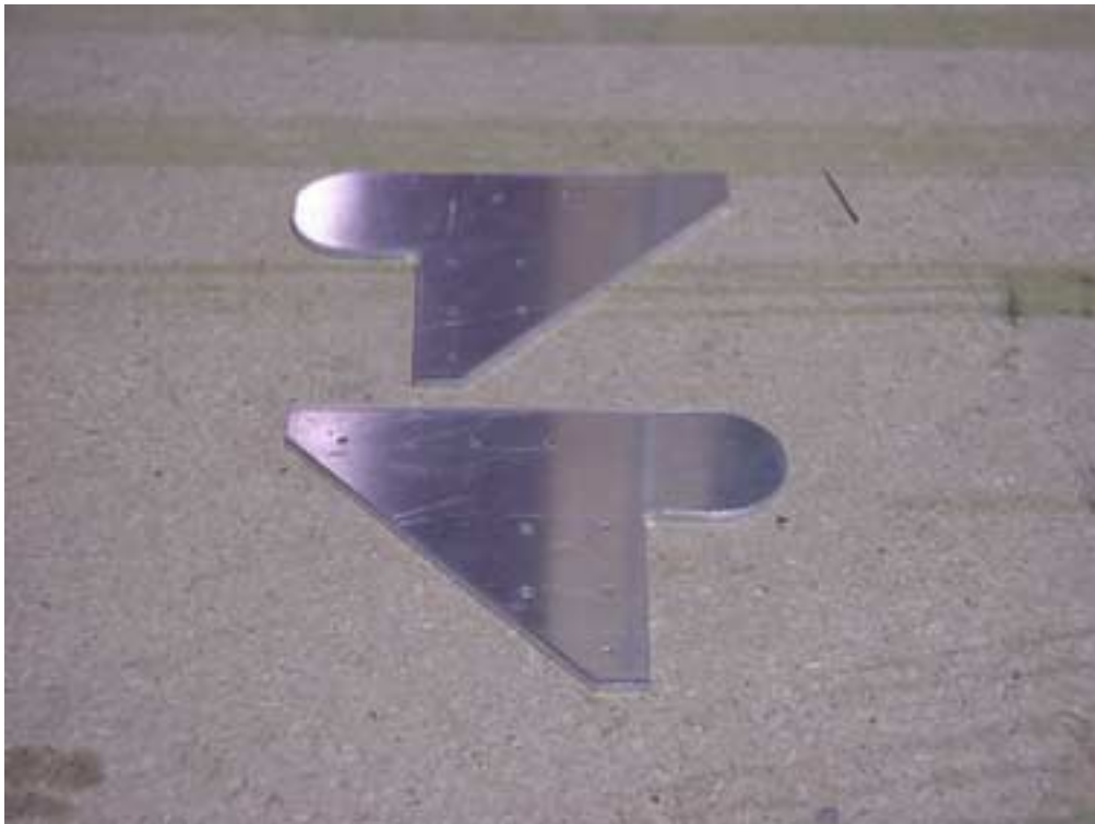
7F5-1SP Rear Wing Attachment

On the top and bottom there will be two A4 rivets drilled.